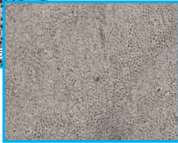
Dentine surface after

After the application, Oxford Protect NANO seals tooth surfaces and releases fluoride directly into the tooth substrate. Oxford Protect NANO contains approx. 0,25% fluoride.